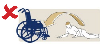
Floor to Bed/Chair