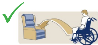
Chair to Chair