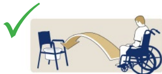
Chair to Commode/Toilet