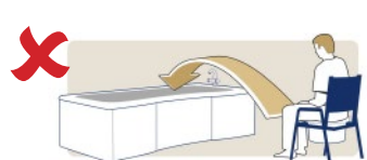
Transfer to Bath