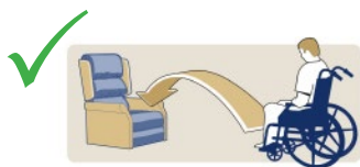
Chair to Chair