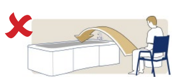
Transfer to Bath