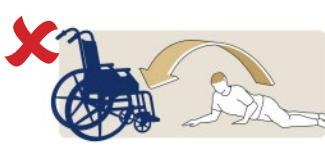
Floor to Bed/Chair