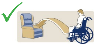
Chair to Chair