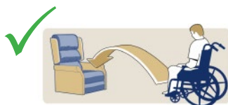
Chair to Chair