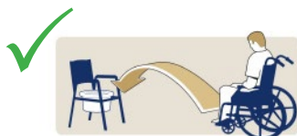
Chair to Commode/Toilet