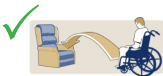
Chair to Chair