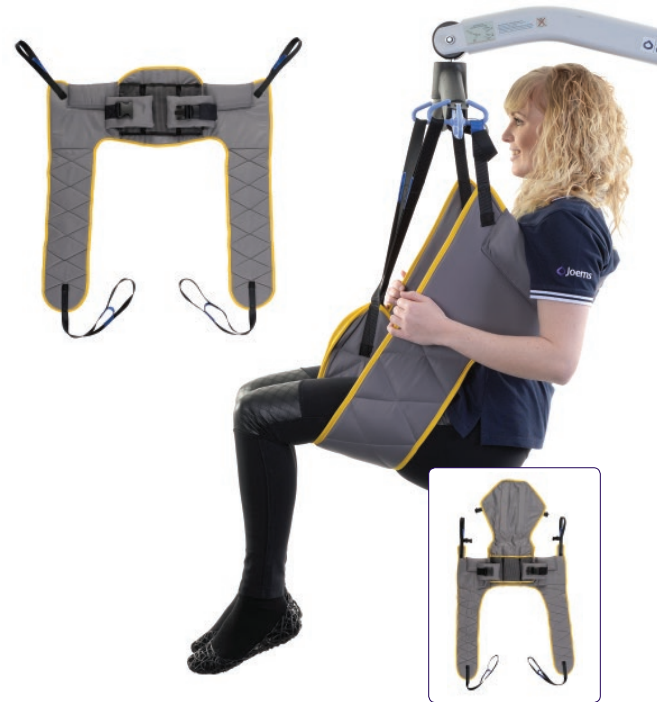
WITH HEAD SUPPORT