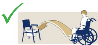
Chair to Commode/Toilet