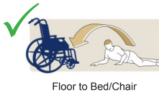
Floor to Bed/Chair