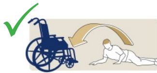
Floor to Bed/Chair