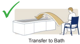
Transfer to Bath