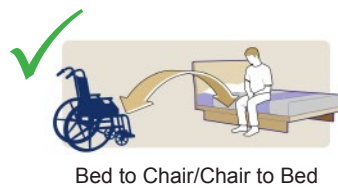
Bed to Chair/Chair to Bed