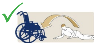
Floor to Bed/Chair