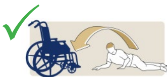
Floor to Bed/Chair