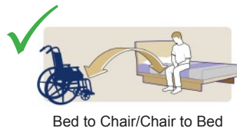
Bed to Chair/Chair to Bed