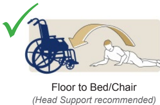
Floor to Bed/Chair (Head Support recommended)