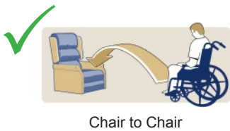
Chair to Chair