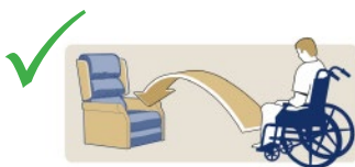
Chair to Chair