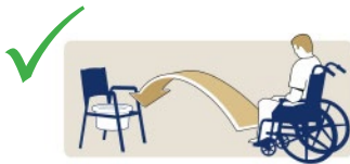
Chair to Commode/Toilet