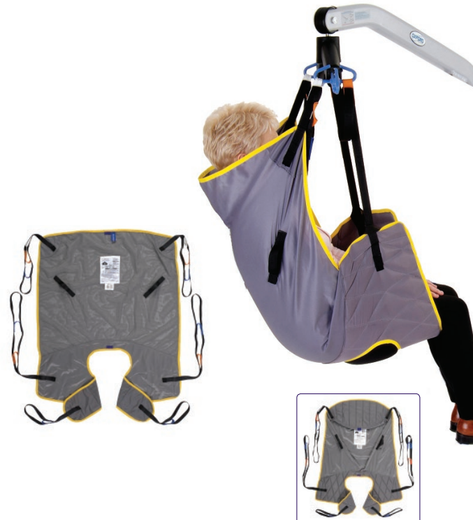
WITH HEAD SUPPORT