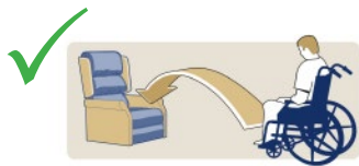
Chair to Chair