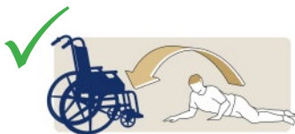
Floor to Bed/Chair (Head Support recommended)