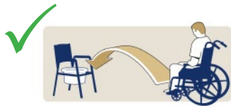
Chair to Commode/Toilet