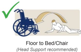
Floor to Bed/Chair (Head Support recommended)