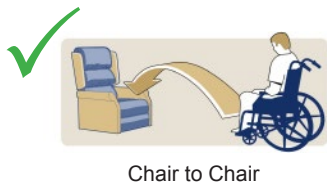
Chair to Chair