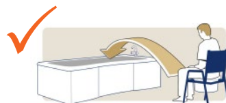
Transfer to Bath