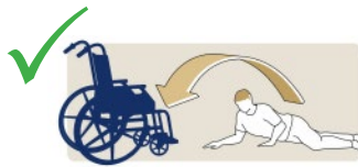
Floor to Bed/Chair (Head Support recommended)