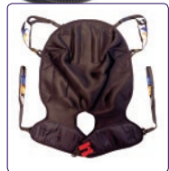
WITH HEAD SUPPORT