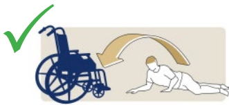
Floor to Bed/Chair (Head Support recommended)