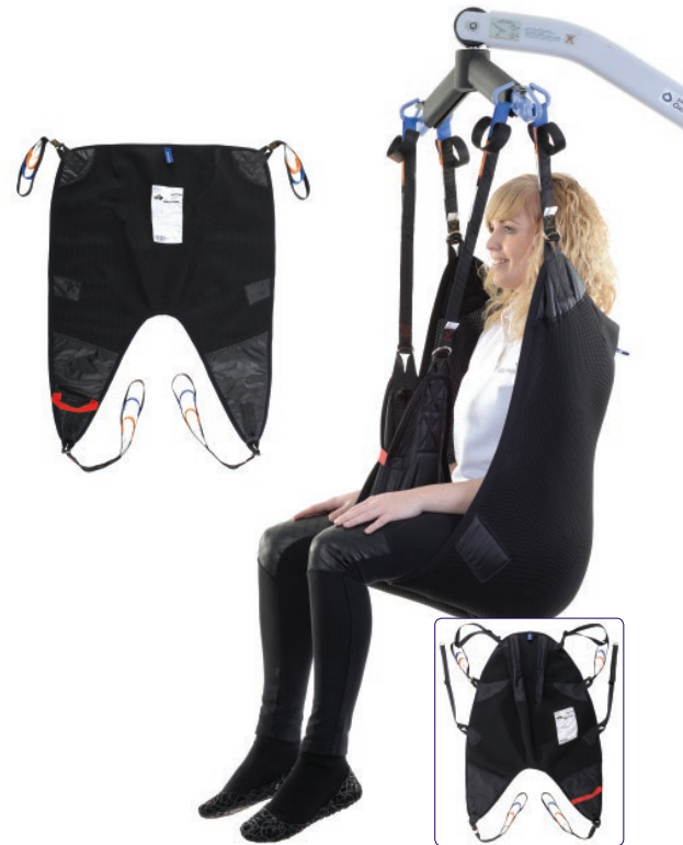
WITH HEAD SUPPORT