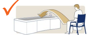
Transfer to Bath