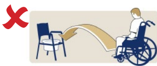
Chair to Commode/Toilet