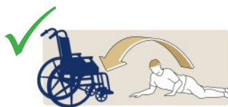
Floor to Bed/Chair (Head Support recommended)