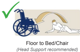
Floor to Bed/Chair (Head Support recommended)