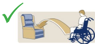
Chair to Chair