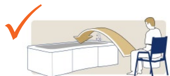
Transfer to Bath