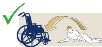
Floor to Bed/Chair