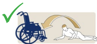
Floor to Bed/Chair