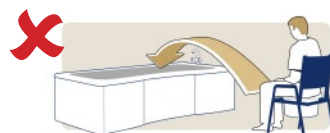
Transfer to Bath