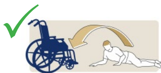
Floor to Bed/Chair (Head Support recommended)